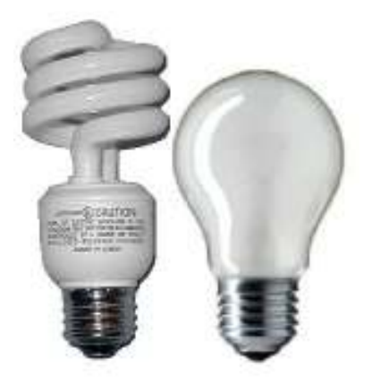
CFL and Incandescent bulbs

heats up mercury gas inside the bulb which in turn causes material on the glass tube to give off visible light.