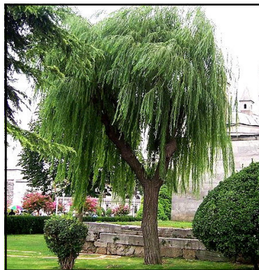
A Weeping Willow

There are many kinds of willow trees, but they all have soft, tough wood, thin branches, and large roots. The leaves usually are long and thin but may be round or oval-shaped. A willow tree is a deciduous tree, which means it sheds its