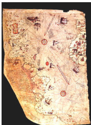
Piri Reis Map