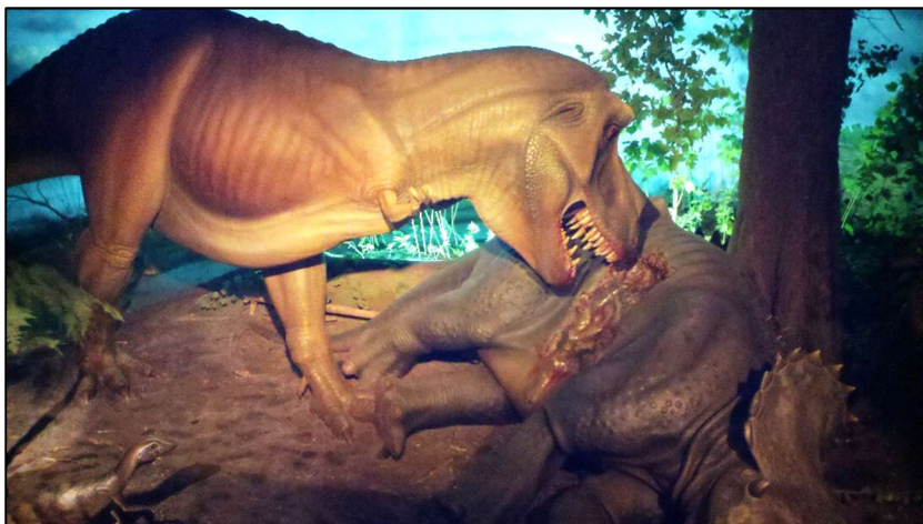
T-rex eating Triceratops 10

longer loved and trusted God as they had before. Their corrupt thinking (their sin) separated them from God, just as our sin separates us from God. Because of Adam's rebellion, God cursed the earth, causing weeds to grow. The animals were also affected, and they eventually began to kill each other. Suffering and death entered the world because of the rebellion of Adam and Eve.