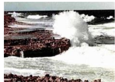
In the beginning God created the heavens and the earth. Genesis 1