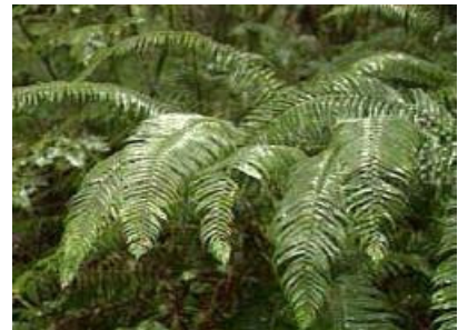
Lush, green forest before the Flood

Sin was rampant. Intermarriage between the believers and unbelievers caused a degeneration of mankind. God was forsaken. Might made right. Those who were strongest were revered. Following God’s way was no longer sought. God could not allow mankind to continue along this path. But God is a God of mercy and grace. He allowed mankind 120 years to repent.