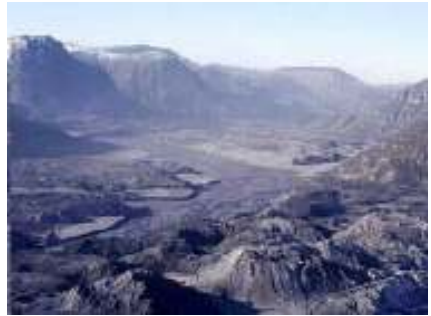
North Fork Toutle River valley showing debris avalanche caused by the volcano.

Less than five days after the initial explosion, rills and gullies over 125 feet deep and resembling badlands topography had already formed. Geologists had assumed it would take hundreds and thousands of years for such features to form on earth.