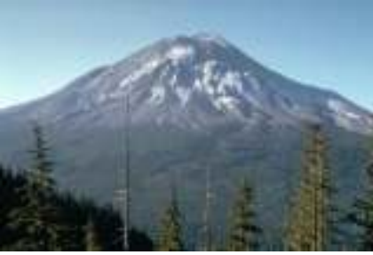
Mount St. Helen's Before the Blast

ning quantities are known; 2. that there has been a constant rate of decay, and 3. that the decaying process has happened in a closed system.